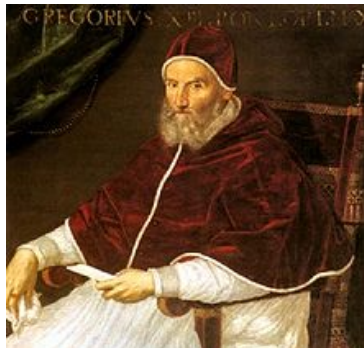
Pope Gregory XIII

“ Da Reforma do Calendário — Tendo-se observado, que desde a celebração do concílio de Niceia, em 325, até ao ano de 1582, se haviam antecipado os equinócios 10 dias do assento fixo em que os colocara Dionísio Romano; (...) mandou o papa Gregório XIII proceder à reforma do Calendário, em virtude da qual se determinou: (...)