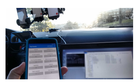
(a) One annotation and three recording applications running on multiple devices