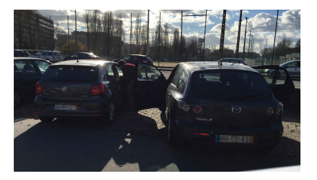
(a) Both cars in preparation for the experiment