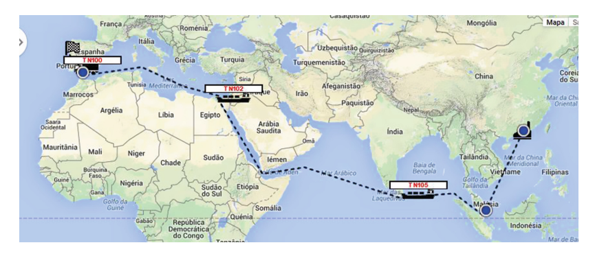
Fig. 2 Example of a route used in pilot