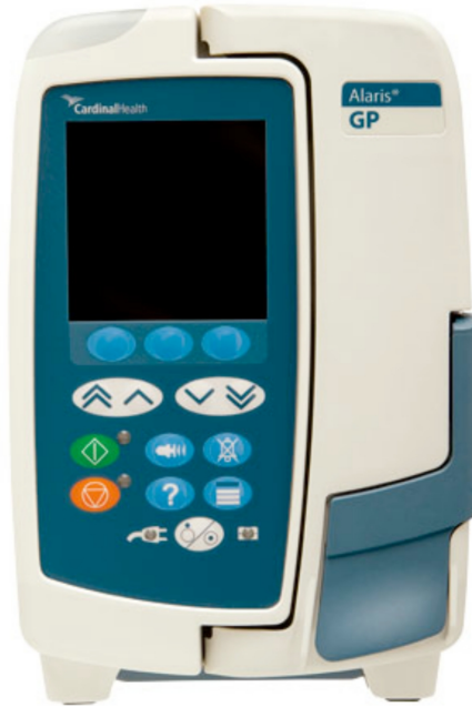
Fig. 1 The Alaris GP Volumetric Pump (from [14])

Most infusion pumps have three basic states: infusing, holding and off. In the infusing state the volume to be infused (vtbi) is pumped into the patient intravenously according to the infusion rate. While in the infusing state the vtbi can be exhausted, in which case the pump continues in KVO (Keep Vein Open) mode and sets off an alarm. In holding state values and settings can be changed.