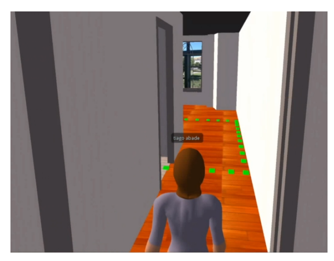
Fig. 6 Guidance lights

was controlled by one of the team members while a second member recorded the discussion. This provided a setting similar to that of watching a play or movie on TV, something the members of the focus group would be accustomed to. The idea was that the presentation of a group of scenarios would be used as a baseline with the possibility of changing the trajectory of any of the scenarios in response to user feedback. The team member who was controlling the prototype asked questions and promoted discussion within the focus group.