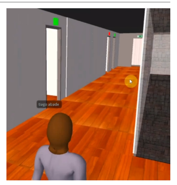
Fig. 7 Presence lights

Group members were all in the 70+ age group. They expressed no knowledge or understanding of smart houses or ambient assisted living. When the virtual environment was presented it was possible to observe that residents identified the environment with the house. They were able to identify which rooms belonged to whom. The fact that the group were immersed in the environment in a visceral way was particularly evident when