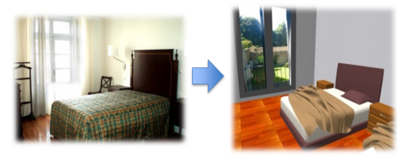
Fig. 4 A physical and corresponding virtual bedroom