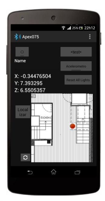
Fig. 5 The Android app showing an alarm's location

proposal was to use the WiFi signal for estimating a resident's location. At this stage the focus was in understanding the users' reaction to the functionality, rather that exploring its implementation