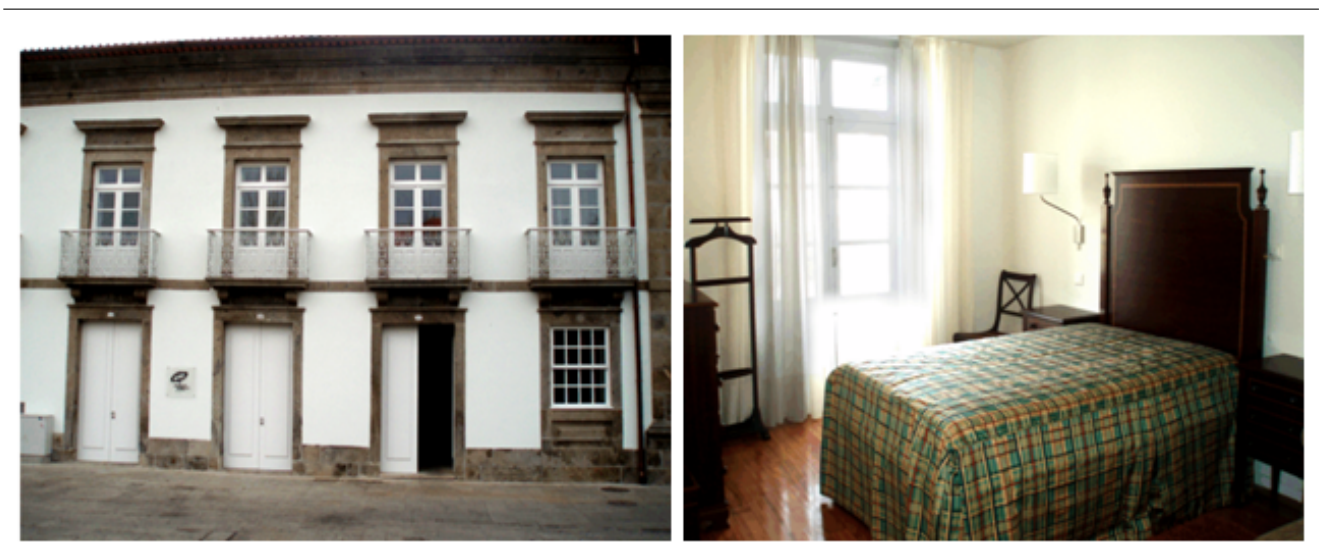
Fig. 1 Care home at Braga

not possible for example to log those who enter or leave the building.