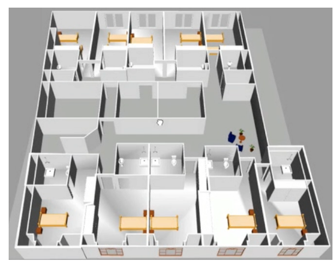
Fig. 3 Creating the virtual world from the blueprint

Pictures of the surrounding area, as seen though the windows of the building, were used to make the environment more realistic. Figure 4 shows, side by side, an actual room from the house and its virtual counterpart. The virtual environment required two person days of effort once the blueprint and photographs were available.